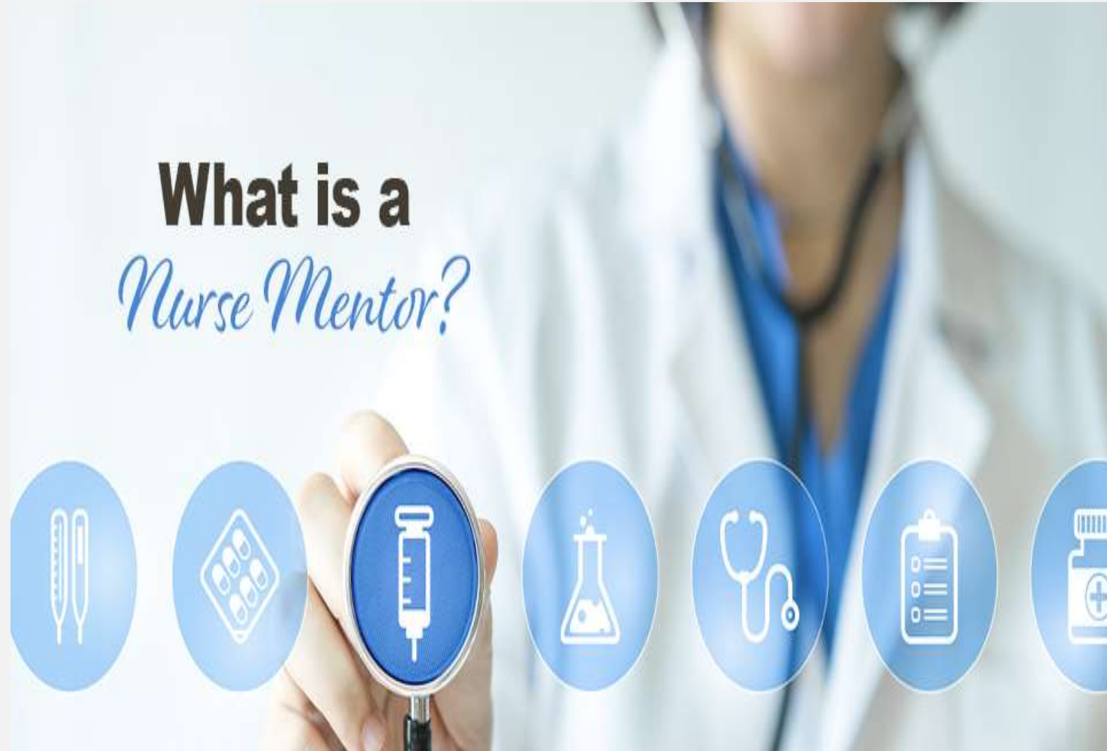
Figure 1: Elements of nursing mentorship (Dimond, 2022)